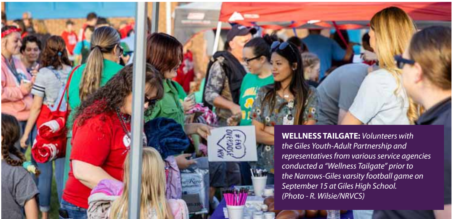
WELLNESS TAILGATE: Volunteers with the Giles Youth-Adult Partnership and representatives from various service agencies conducted a “Wellness Tailgate” prior to the Narrows-Giles varsity football game on September 15 at Giles High School.