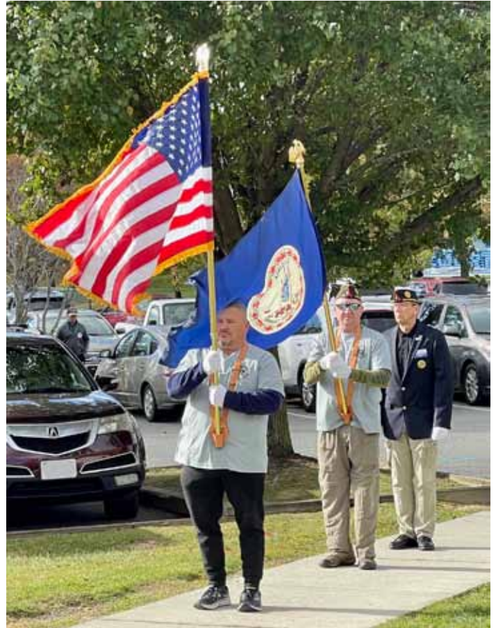
STANDING UP FOR SUICIDE PREVENTION: Members of Christiansburg Post 59 of the American Legion present our nation's colors during the opening ceremony for the 2nd Annual NRV "Out of the Darkness" Walk for Suicide Prevention, held in Dublin on Saturday, October 21, 2023.

Virginia veteran suicide deaths in 2020: 181