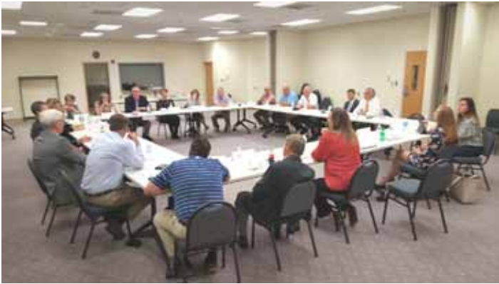
Inaugural meeting: Representatives from all five jurisdictions served by NRVCS took part in the first-ever meeting of the New River Valley Regional Coalition & Drug Court Advisory Committee, held Monday, September 30, 2019 at the NRV Business Center in Fairlawn.